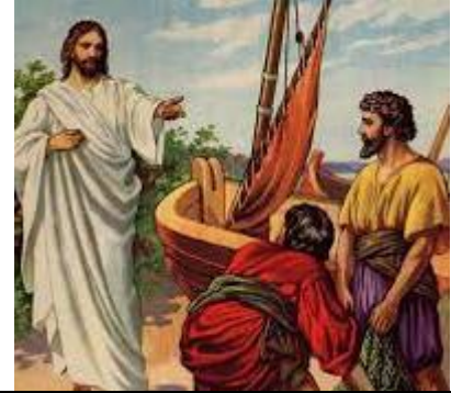
The apostles were called by Jesus

Sponsor – is someone who supports you through your confirmation. It is someone who inspires you in the way of faith.