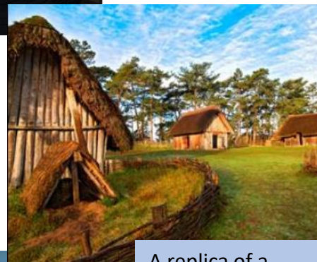
A replica of a Saxon village.