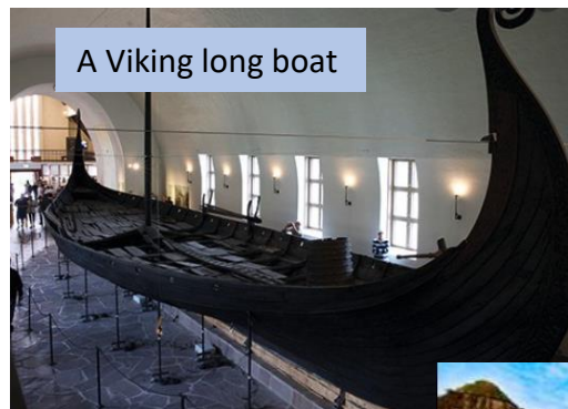
A Viking long boat

Vikings formed early cities such as Dublin and York.