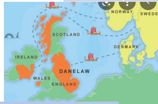
Viking routes of invasion