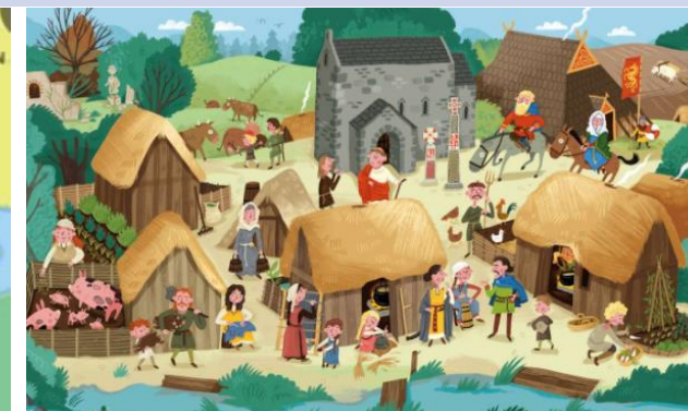
An Anglo-Saxon village